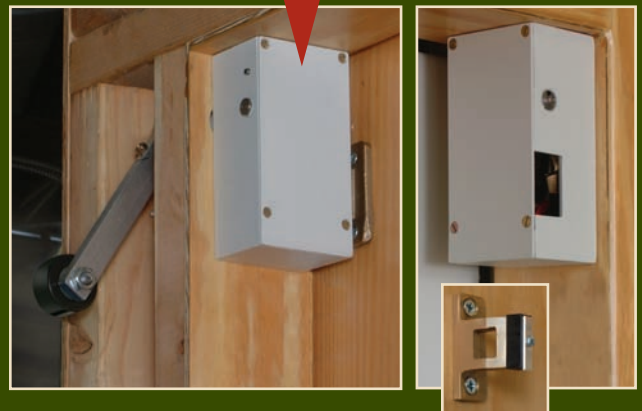
High-quality G.A.L. interlocks help assure safe, secure, and reliable performance.