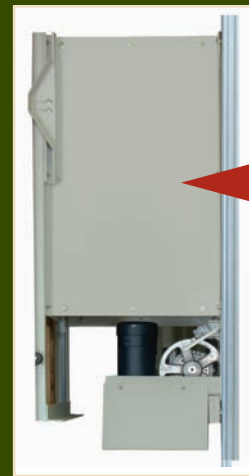
Car and drive system chassis come pre-installed on a short section of track. Extra lengths of track splice together with ease.