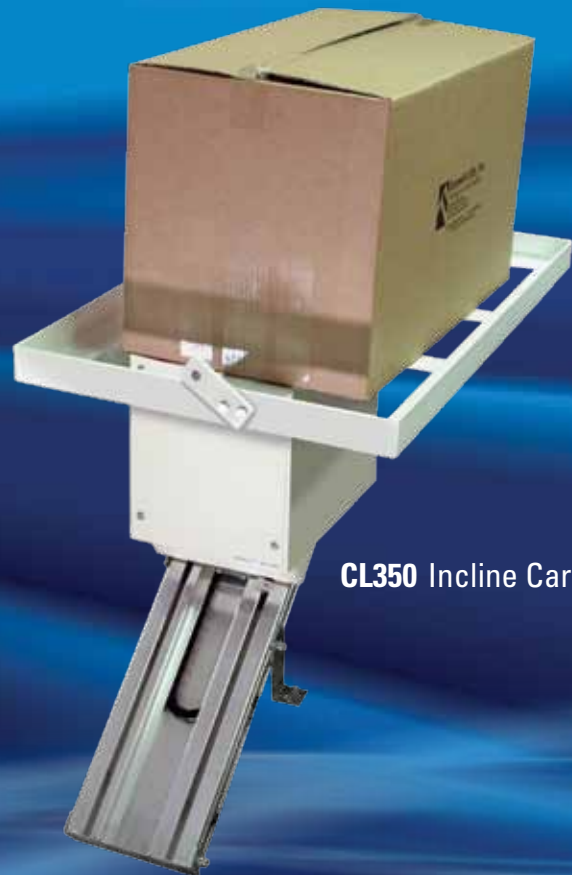
CL350 Incline Cargo Lift