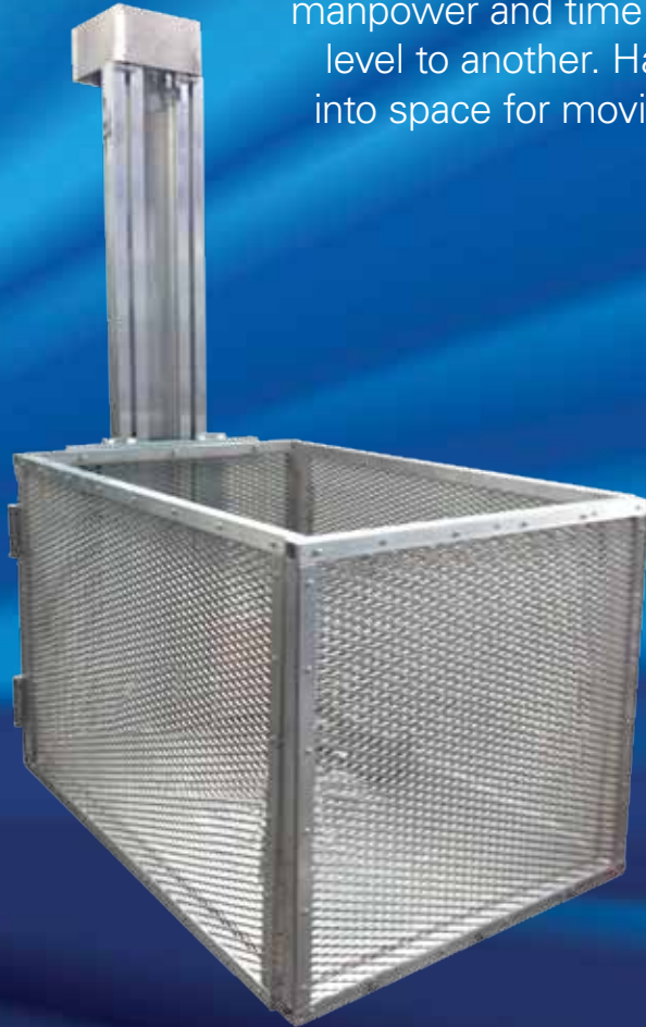
CL250 Coastal Vertical Cargo Lift

Harmar Cargo Lifts make it easier and safer to move heavy or bulky items. The small footprint of the Harmar Coastal Lift saves manpower and time as it transports supplies easily from one level to another. Harmar Cargo Lifts turn a current stairway into space for moving goods. All are fast and easy to install.