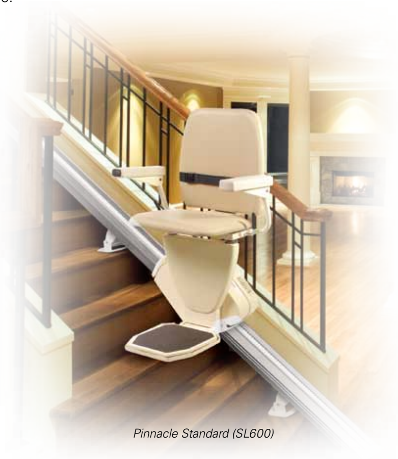
Pinnacle Standard (SL600)