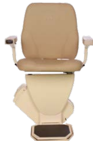
Pinnacle Signature Edition (SL600S)