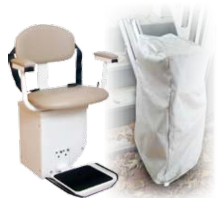
Weatherized Outdoor Model