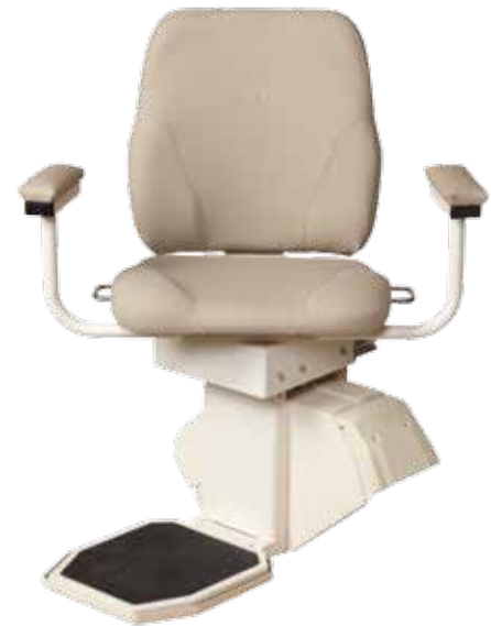
Heavy-duty 600 lbs. capacity!