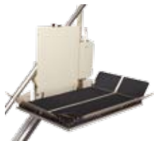
Inclined Platform Lifts