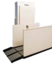
Vertical Platform Lifts