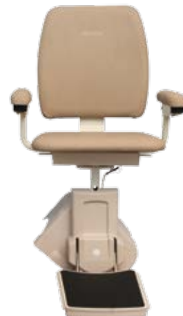
Alpine Signature Edition