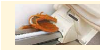
Safety sensors on carriage and platform stop the lift instantly at obstacles.